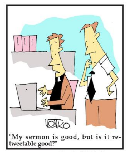
from JoyfulNoiseletter.com