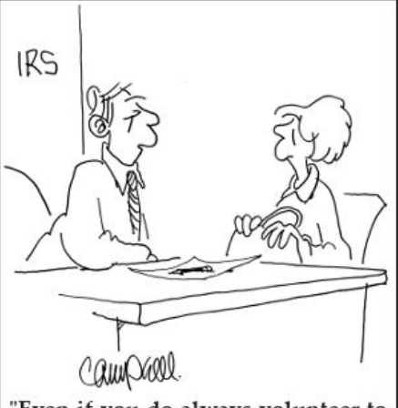
"Even if you do always volunteer to supply the food for church suppers, you may not claim the congregation as dependents."

from JoyfulNoiseletter.com Reprinted with permission