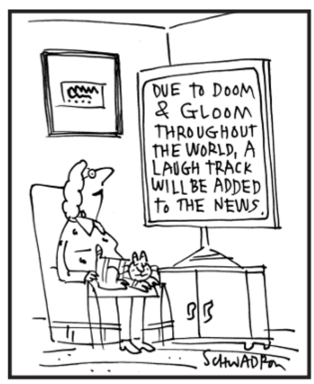
from JoyfulNoiseletter.com

The following are taken from The Joyful Noise newsletter with permission.