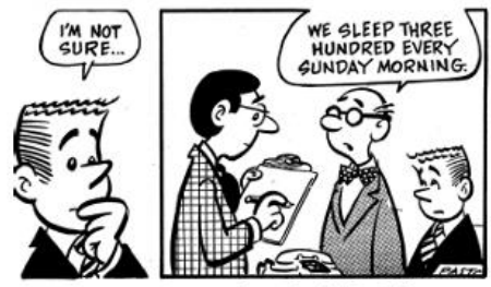
from JoyfulNoiseletter.com ©Doc Goodwin (Phillip's Flock) Reprinted with permission