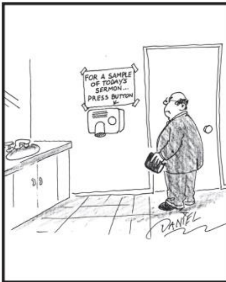
from JoyfulNoiseletter.com Reprinted with permission