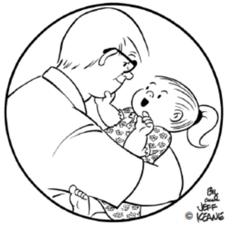
"You're better than just a father. You're a DADDY!" from JoyfulNoiseletter.com