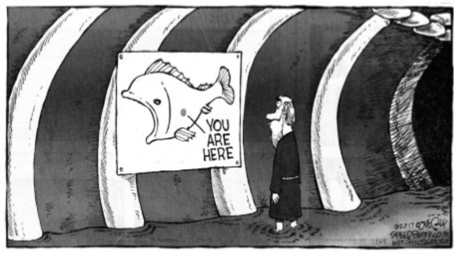
from JoyfulNoiseletter.com © Dave Coverly Reprinted with permission