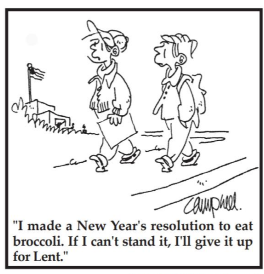
from JoyfulNoiseletter.com ©Martha Campbell Reprinted with permission

The following are used with permission from The Joyful Noiseletter