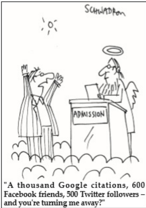
from JoyfulNoiseletter.com ©Harley L. Schwadron Reprinted with permission

The following are from "The Joyful Noiseletter" used with permission