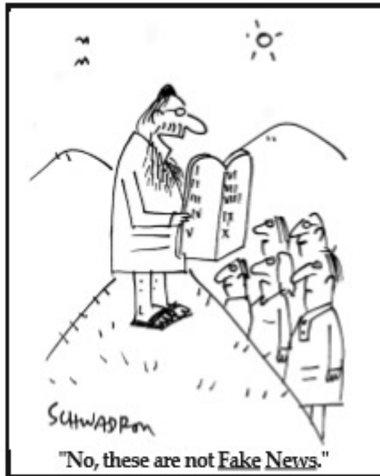
from JoyfulNoiseletter.com Reprinted with permission