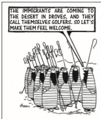
from JoyfulNoiseletter.com Reprinted with permission