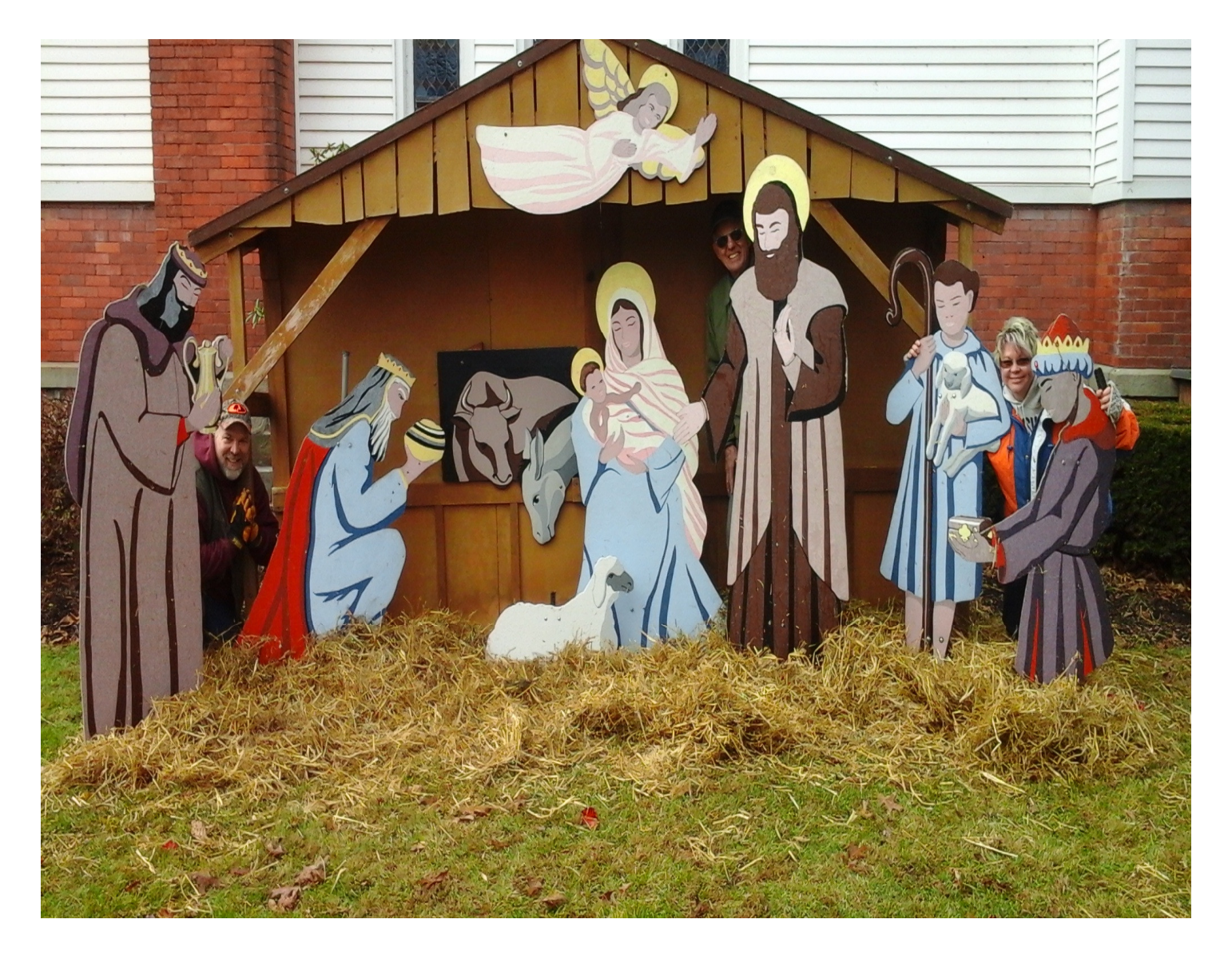
Can you find three extra faces in the crèche?